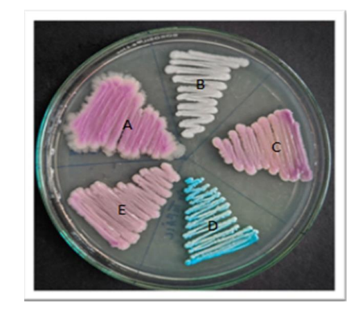
*(A – C. krusei, B – C. glabrata, C – C. parapsilosis, D – C. albicans, E – C. kefyr)

Fig. 1. Photomicrograph of a Gram smear of HVS showing Candida cells with pseudohyphae and epithelial cells (1000x).