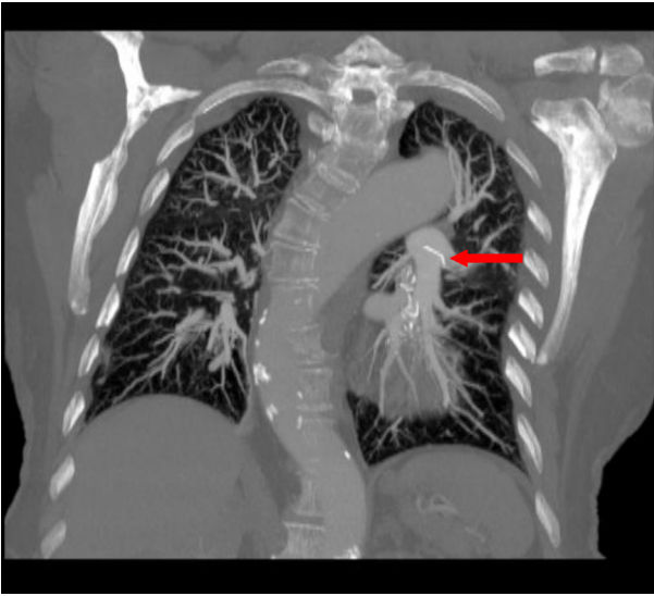
Fig. 1. Red arrow pointing to the IVC filter strut at the pulmonary vasculature. (For interpretation of the references to colour in this figure legend, the reader is referred to the web version of this article.)