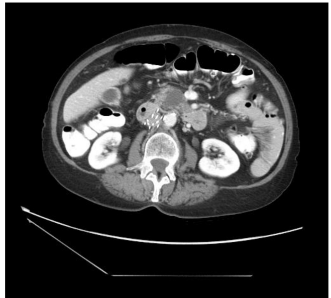
Fig. 3. The abdominal CT shown above was in 12/2008 showing 12 struts as compared to the bottom CT abdomen taken on 9/2010 showing only 11 struts.

with chronic oral anticoagulation. Over the next 4 years the patient's symptoms were monitored through regular clinic follow ups and serial chest CT scans. As of 2/2014, the patient remained asymptomatic and there was no evidence of any complications, including changes in the position of the fractured and migratory strut.