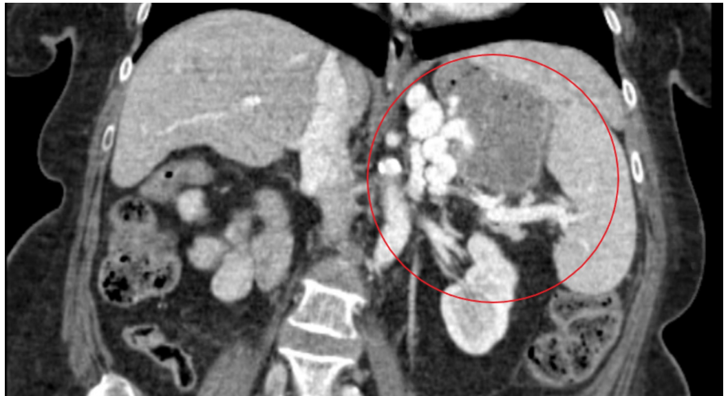
FIGURE 2: CT of abdomen/pelvis with IV oral contrast showing filling defect in the gastric cardia and splenic vein communication (highlighted)

To confirm the mass-like defect noted on the CT of the abdomen, an upper GI and small bowel follow-through series was performed. The lobulated mass-like filling defect in the gastric cardia was consistent with a solitary gastric varix with an abnormal fold pattern (rosette) at the gastric cardia (Figure 3). Once she was deemed hemodynamically stable, she was transferred to an advanced GI center for interventional radiology guided embolization of varix. She subsequently underwent balloon-occluded retrograde transvenous obliteration (BRTO) which confirmed large varix emanating from the mid-splenic vein and connecting through gastric varix into a spleno-renal shunt (Figure 4). This was completely obliterated. Post-embolization venogram demonstrated patency of the splenic vein. She was then discharged with close follow up, and she has since remained free of symptoms.