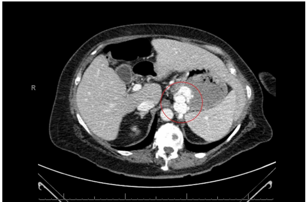
FIGURE 1: CT of abdomen/pelvis with IV oral contrast showing filling defect in the gastric cardia (highlighted)

Since both upper and lower GI endoscopies were consistently negative, we considered the possibility of doing either a capsule endoscopy or a Computed Tomography (CT) angiogram. However, considering the patient's ongoing abdominal pain, a CT abdomen was done, which showed a lobulated mass in the gastric cardia that was suspicious for a solitary gastric varix (Figure 1, 2).