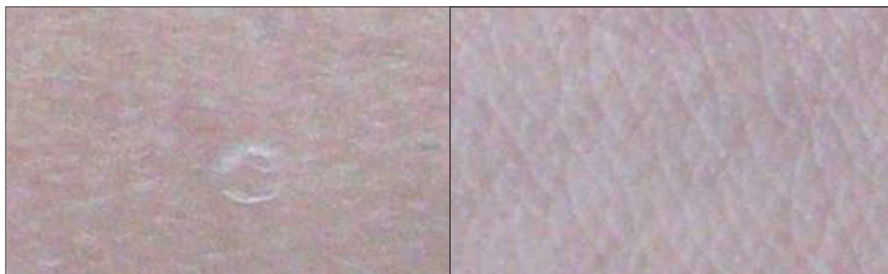
Figure 2: Comparative pictures showing change in skin appearance (Picture taken initially, after 3 rd week)