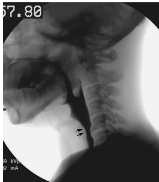
Fig. 3 Fluoroscopic lateral view of posterior cricoid arch impression. Note broad-based flattened appearance at arrows

demonstrated considerable variation in shape between individuals.