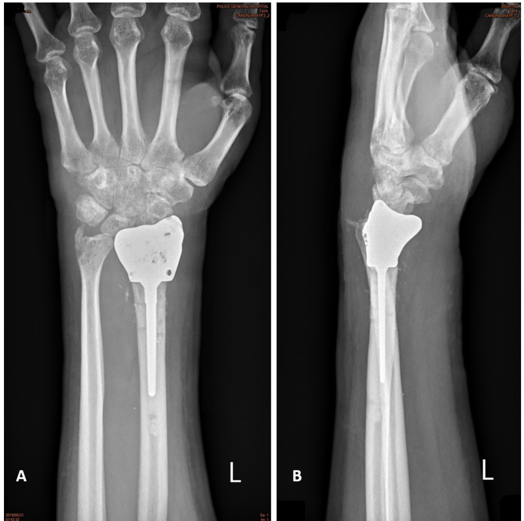
FIGURE 4: Film at thirty postoperative months.

Two months after surgery, the patient was able to resume his daily activities and return to work. Thirty months after surgery, range of motion had improved from fixed 40° flexion and fixed 70° pronation to 73° flexion, 79° extension, 85° pronation, and 75° supination. His DASH (Disabilities of the Arm, Shoulder, and Hand) score prior to surgery was 80. His visual analog scale score for pain was one to two at the end of motion compared to eight preoperatively. His DASH score was 14.2. A plain X-ray showed no sign of instability or an unacceptable alignment (Figure 4). The patient reported satisfactory wrist function and said that he would choose the same treatment again if faced with a similar situation.