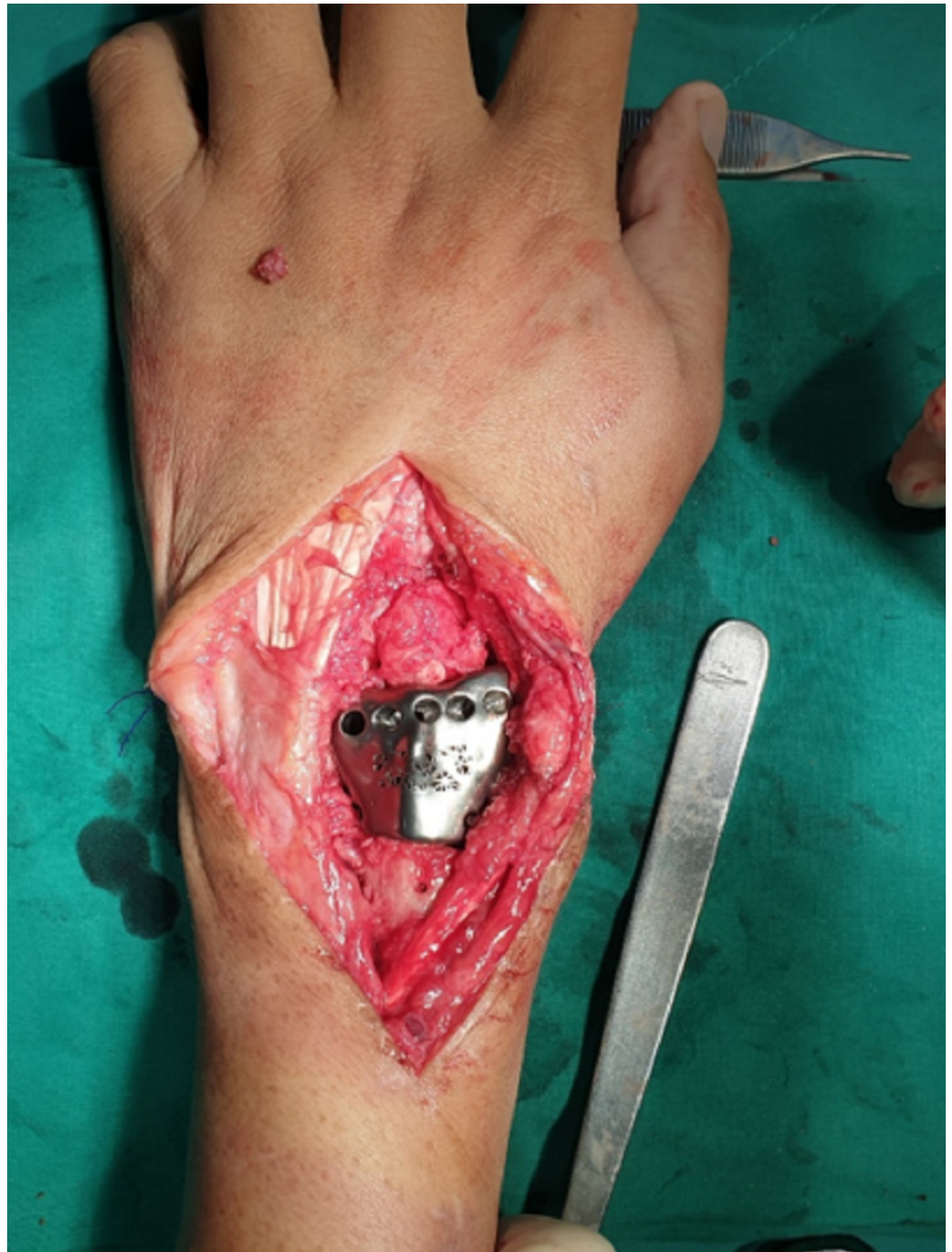
FIGURE 3: Placement of the customized distal radius prosthesis