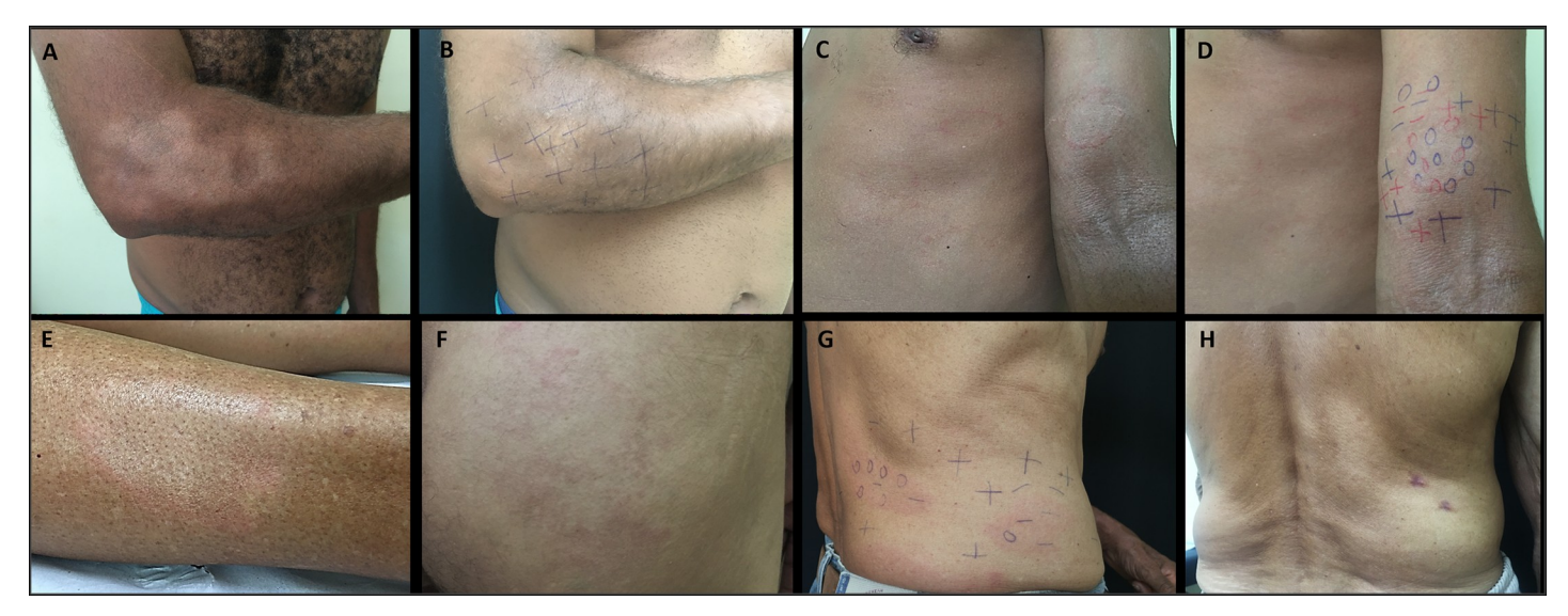
Fig 4. Images of different locations (elbow, arm, leg, buttock, anterior and posterior trunk) of leprosy lesions. (a) Hypochromatic anesthetic macule with irregular edges on the right elbow and forearm; (b) the same previous patient, after 12 months of multi drug therapy, with improvement of skin sensitivity; (c-d) typical borderline lesions on the left arm and trunk; (e) hypochromatic macule with infiltrated erythematous border on the right leg; (f) typical borderline lesions on the buttocks; (g) hypochromatic macules and erythematous plaques on the back; (h) the same previous patient, after 3 months of multi drug therapy with new hypochromatic macules on the back. Legend: 0 (anesthetic point);—(hypoesthetic point); + (normoesthesic point).

https://doi.org/10.1371/journal.pntd.0009495.g004