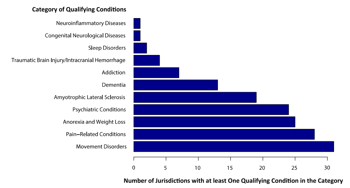
Fig. 1. Categories of neurological conditions listed for medical use of cannabis in 30 states and Washington, D.C.

weight loss. Notably, 46 conditions were qualified for medical use by just one jurisdiction (Table 1 and Supplemental Material S1).