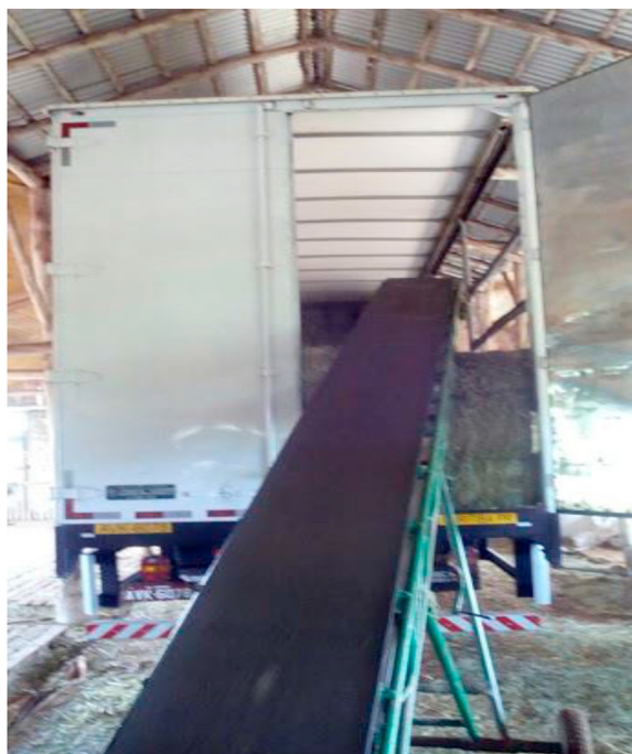
Figure 7. Loading hay for sale.

pallets should be placed on the floor to prevent direct contact between hay and floor and moisture changes. Commercial hay producers store hay using a storage system when there is excess production during summer so that the market value will increase in times when supplementation with roughage is scarce, that is when supply is low and demand is high. In this system, the storage structures are concrete sheds with aluminum roofing and ventilation.