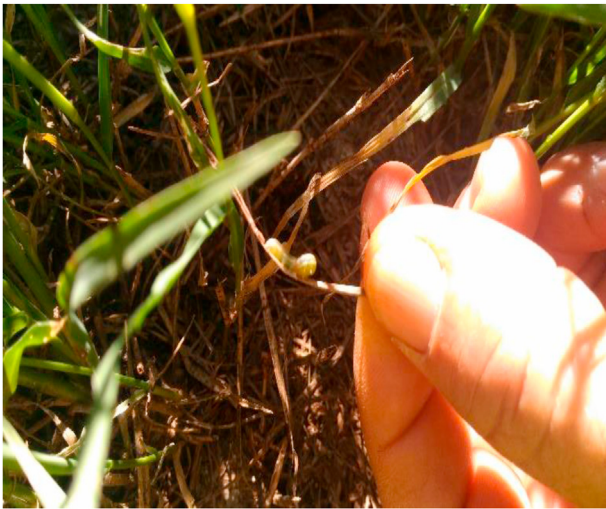
Figure 5. Caterpillar infestation in a Tifton 85 hay production area.

In the studies by Machado et al. (2019) and Neres et al. (2011) with Tifton 85 Bermudagrass and Vaquero grasses, under high solar radiation and winds, the use of the conditioner did not take more than 2 h in windrowing and baling of fodder. During autumn/winter, the conditioner effect is more pronounced, especially on oat because it has thicker stems than Tifton 85 Bermudagrass.