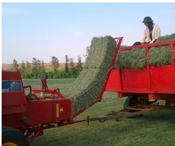
Figure 2. Production of prismatic bales in Marechal Cândido Rondon, State of Paraná.

In Southern Brazil, hay production is carried out by corn, soybean, and milk producers. Some farmers specialize in hay production on their property, or leased land, and also provide services to third parties. Those who produce hay and crops reported that the activities do not compete