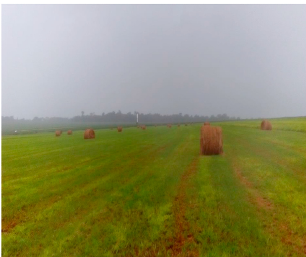
Figure 1. Baled, moist hay caused by precipitation before storage (personal file).

Hay is conserved roughage with low water content (approximately 15 g/kg); thus, its production was intended not only for use on the property but also for sales. This literature review aimed to approach the related aspects to hay technology advances in Brazil and its effects on plant nutritional value, sanitary quality, and physiological responses, as well as the ideal hay storage systems in tropical conditions.