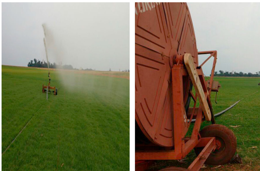
Figure 4. Irrigation of hay producing areas with ARS (swine wastewater) in a reel system (personal file).