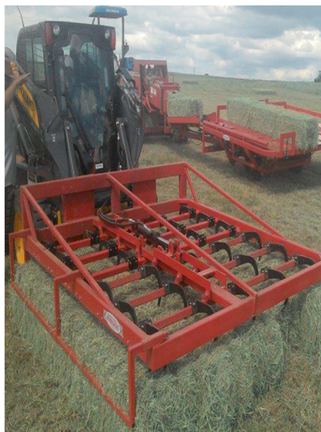
Figure 3. Hay pickers found in the country, imported and national (personal file).