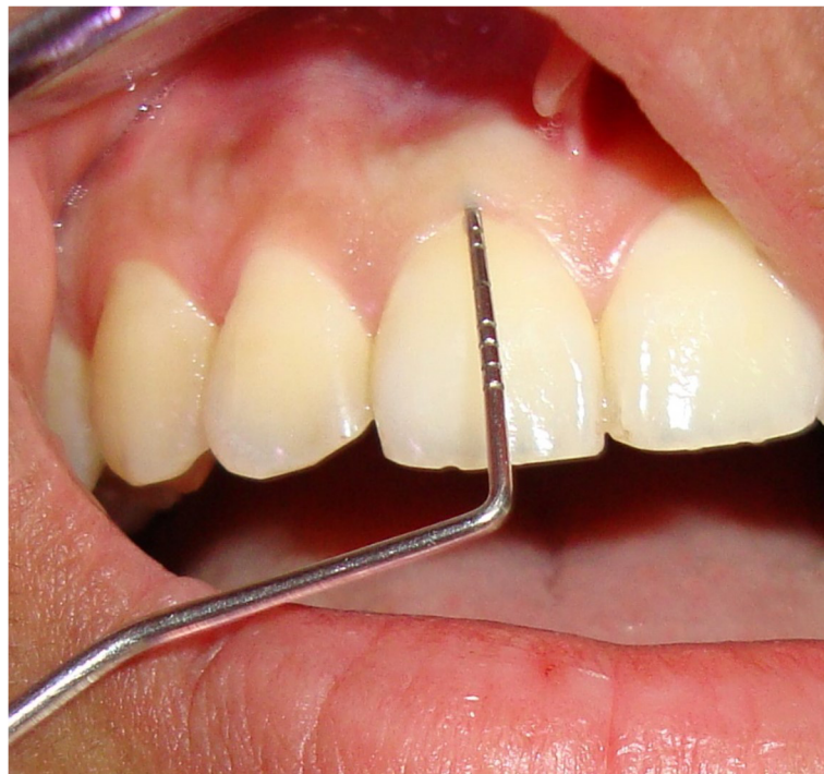
Fig. 3 Probe visible through sulcus (thin gingival biotype)

It was a cross-sectional study involving consented patients who have received dental implants therapy at Faculty of Dentistry, Melaka-Manipal Medical College, Malaysia, between March 2011 and March 2017. The study was approved by the Ethics and Research Committee of Faculty of Dentistry, Melaka-Manipal Medical College, Malaysia and conducted in accordance with the Helsinki Declaration of 1975, as revised in 2000. In this