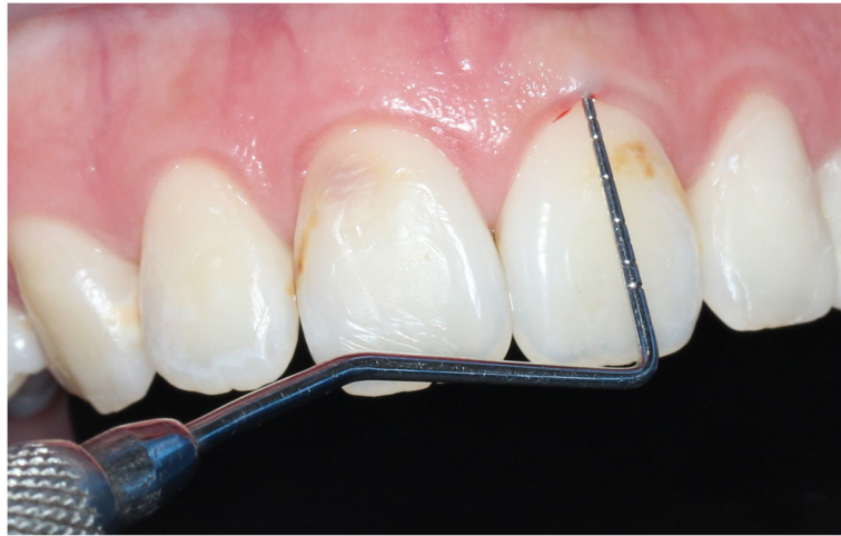
Fig. 2 Probe not visible through sulcus (thick gingival biotype)

Hence, the objective of this study was to evaluate the association between peri-implant bleeding on probing in peri-implant diseases and its association with multilevel factors which include site specific factors (gingival recession, bone loss, pocket depth, and peri-implant gingival biotype), implant level factors (position and duration of implants), and patient level factors (age, gender, ethnicity, smoking, and systemic diseases) which highlights on the functional aspect of peri-implant gingival biotype.