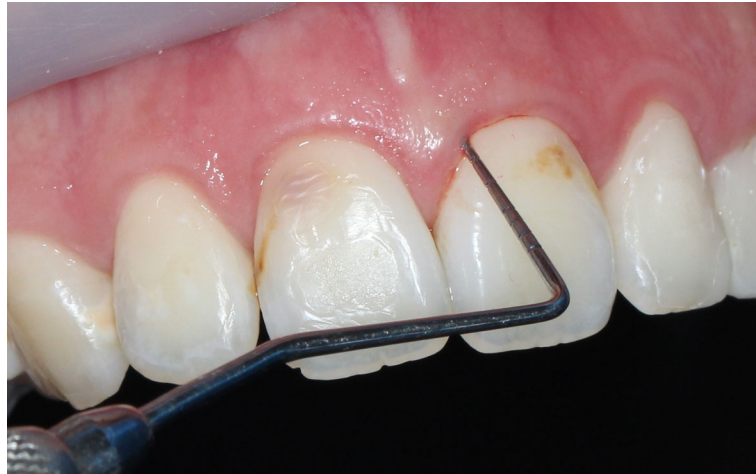
Fig. 1 Peri-implant bleeding on probing

diagnosis from a healthy implant to mucositis, as well as from an unclassified situation (probing depth+, BoP, Bone Loss+) to peri-implantitis [9].