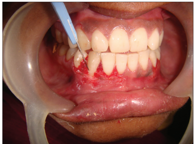
Figure 2: Cytological smears prepared by exfoliating from the labial surface of the gingiva