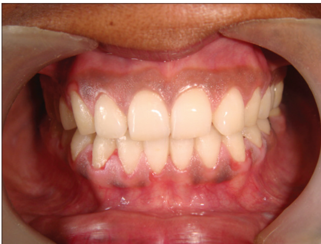
Figure 1: Gingival desquamation

PV is an autoimmune disease that is characterized by acantholysis (loss of cell-to-cell contact) in the epithelium, [1,2,8] with a positive Nikolsky’s phenomenon which was seen in our study. Histologically, there is presence of intraepithelial blister, rounded acantholytic, and Tzanck cells, [2,4,7] demonstrating degenerative changes, including round, swollen hyperchromatic nuclei with a clear perinuclear halo in the cytoplasm, [8] which was also evident in our study. According to Coscia-Porrazzi et al. , acantholytic/Tzanck cells were recognized in 37 out of 40 PV patients and stated that cytomorphologic studies are useful to screen the cases suspected to be oral PV. [8] In our study, acantholytic cells were seen in the cytological smear, which enabled us to make a presumptive diagnosis of PV.