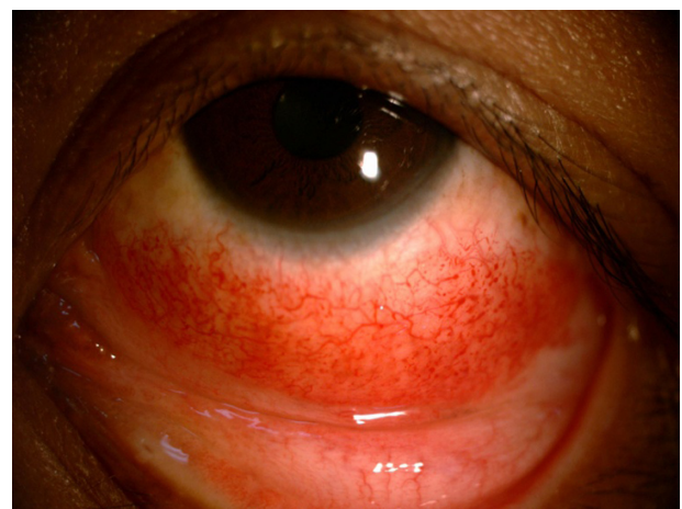
Figure 3 A 31-year-old woman who presented with a petechial hemorrhage above a conjunctival mass in the inferior area.