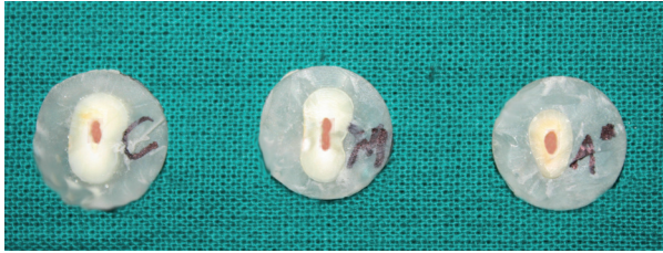
Fig. 1: Tooth samples showing obturated tooth root.