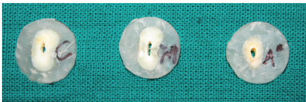
Fig. 3: Tooth samples showing dislodged obturated material from tooth root.

ble 3), the push out bond strength at middle and apical of Resilon group was found to be significantly ( p < 0.01 and p < 0.001 respectively) different and higher as compared to at coronal. Further, in Resilon group, the mean push out bond strength at apical was also found to be significantly ( p < 0.001 ) different and higher as compared to at middle.