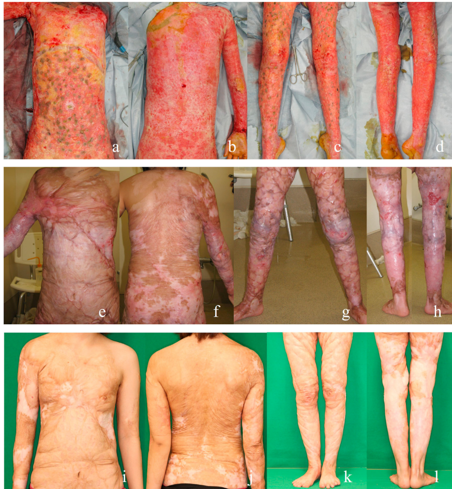
Fig. 2. Clinical photographs of the patient from immediately after surgery to 10 years after surgery. (a–d) At the time of cultured epidermal autograft (CEA) transplantation after autologous patch skin grafting. (e–h) One year after CEA transplantation. (i–l) Ten years after CEA transplantation.