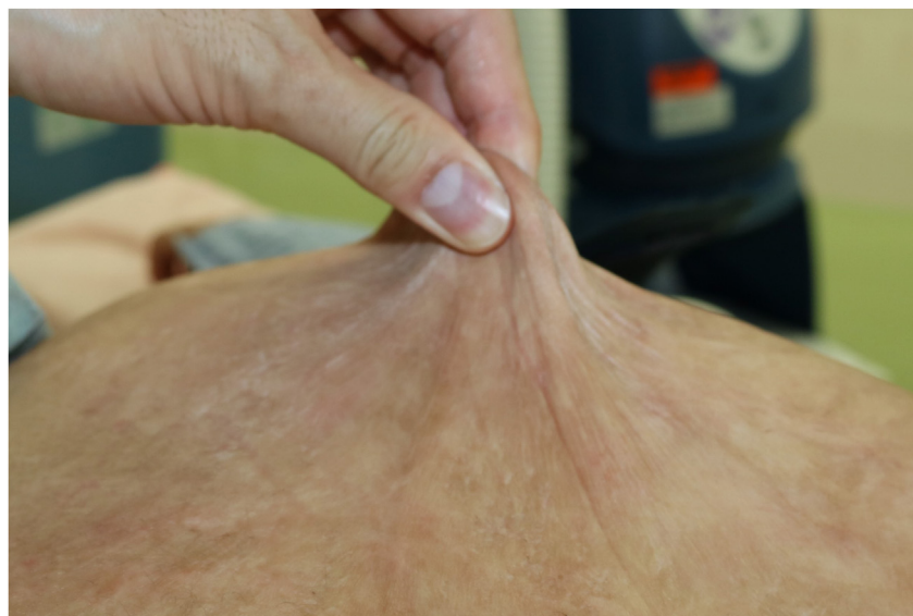
Fig. 3. Clinical photograph of pinched upper right back skin 11 years after cultured epidermal autograft transplantation.