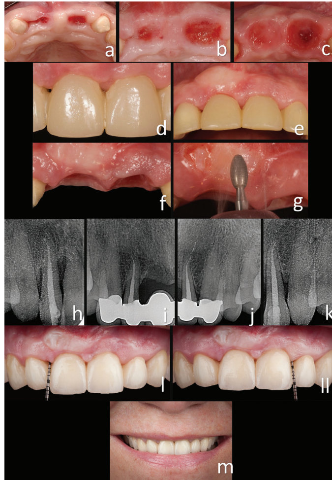
Fig. 3: a, b, c) Improved soft tissue volume. d, e, f, g) The third surgical phase was performed before the final prostheses were placed. A diamond burn was used to remove part of the grafted epithelium. h, i, j, k) A significant improvement in the underlying bone was observed, despite no bone grafting having been carried out. l, ll) After the second surgery, the soft tissue margin of the papilla was 3–4 mm more incisal than before the surgery. This represented an improvement of approximately 4 mm in the periodontal junction. Three years later, the clinical results recorded within three months of surgery had not only been maintained but had in fact improved, as there was no “black triangle” in the lateral and central incisor area. m) Final situation after three years.