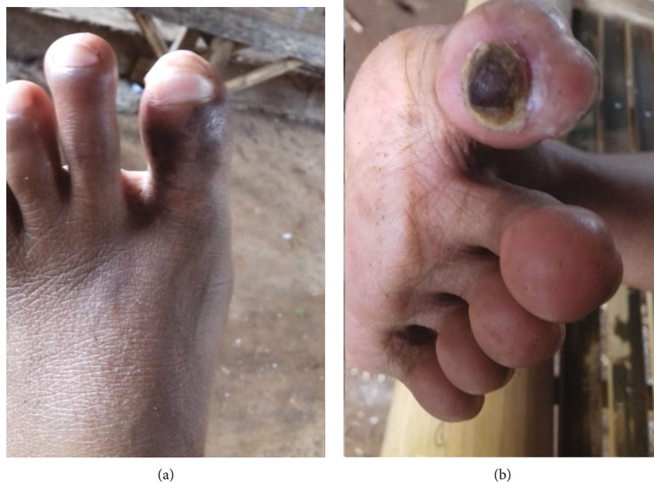
FIGURE 3: Image of dorsal (a) and ventral (b) views of the left foot in the six-month follow-up, with significant clearing of cyanotic area.

In cases of ALI associated with neurological deficits, immediate revascularization is mandatory; investigations and imaging should not delay patient revascularization interventions [13]. Various revascularization modalities can be applied, including percutaneous CDT, percutaneous mechanical thrombus extraction or thrombus aspiration (with or without thrombolytic therapy), and surgical thrombectomy, bypass, and/or arterial repair. The choice of a revascularization strategy will depend on the presence of a neurologic deficit, duration of ischemia, localization, comorbidity, type of blood vessel (artery or graft), and therapy-related risk and outcome. Because of favorable morbidity and mortality rates, endovascular therapy is often preferred by clinicians, especially in patients with severe comorbidities [1, 18].