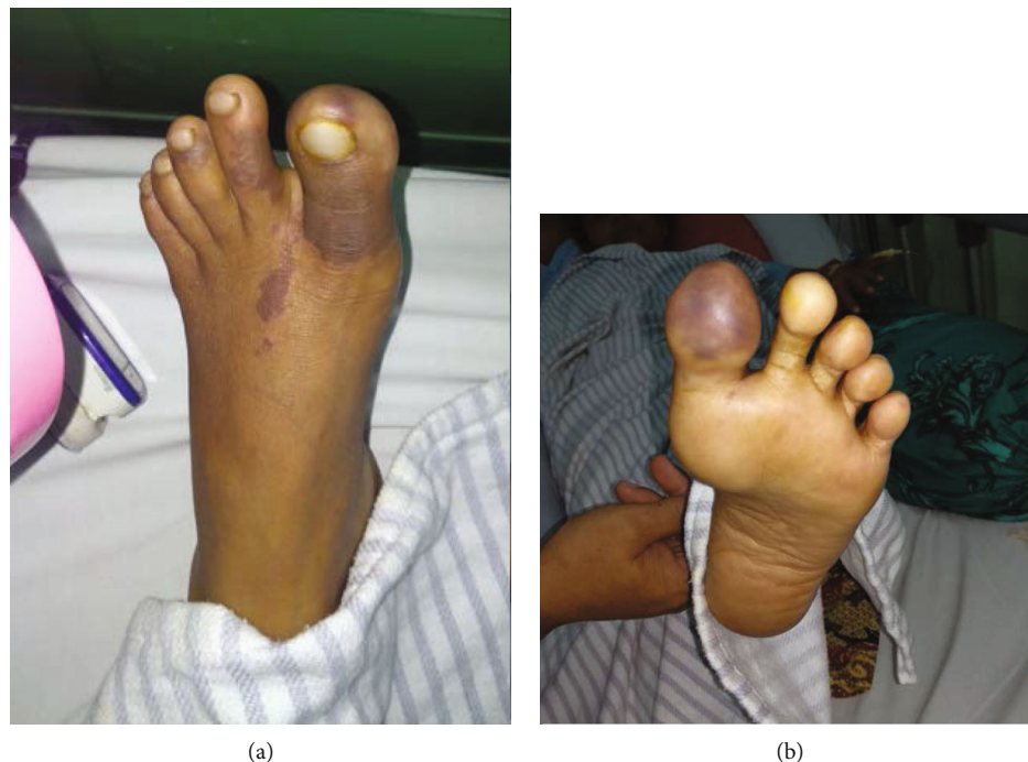
FIGURE 1: Image of dorsal (a) and ventral (b) views of the left foot in the initial settings with bluish pale area mostly distributed in digits I and II.

a JAK-2 mutase examination was performed based on the suspicion of ET.