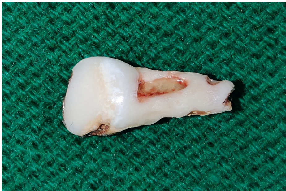
FIGURE 4: Excised intranasal tooth.

showed a root/crown ratio of \sim 2 , and the mesiodistal diameter of the crown exceeded its cervico-incisal length (Figure 4). Both these findings, along with an absence of upper central incisor on clinical examination, confirmed the nasal tooth which is consistent with a deciduous maxillary central incisor.