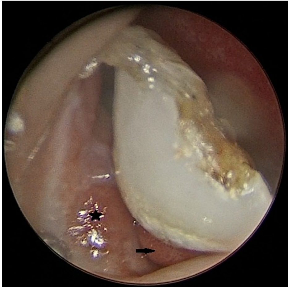
FIGURE 1: Endoscopic nasal examination shows a white mass arising from the floor of right nasal cavity. The mass is related laterally to inferior turbinate (black star) and is surrounded by granulation tissue at its base (black arrow).

Oral examination showed a missing right upper central incisor tooth (Figure 2).