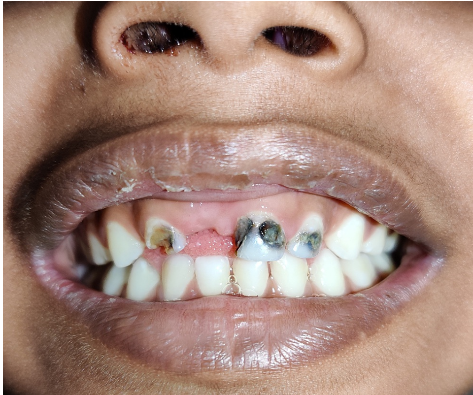
FIGURE 2: Oro-dental examination shows an absence of primary central maxillary incisor on the right side.

The CT scan showed a radio-opaque mass located in the floor of the right nasal cavity between the inferior turbinate and the nasal septum. The mass was surrounded posteriorly by soft tissue, consistent with the clinical finding of granulation tissue. With the bone window setting of a 500-HU window length (WL) and 1500-HU window width (WW), the lesion was noted to have a homogeneous high attenuation equivalent to that of the teeth and its root was buried in the mucosa of the nasal floor but was not surrounded by any bony socket. A slit-like cavity in sagittal cut and a focal central radiolucency in coronal cut, both correlating to the pulp cavity was seen (Figure 3). These findings confirmed a diagnosis of the nasal tooth.