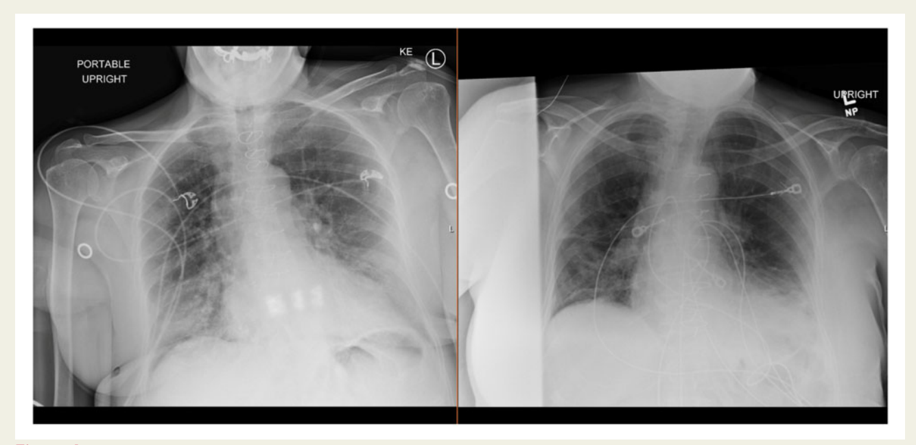
Figure 1 Left is from hospital admission Day 1 and right is from hospital admission Day 6 on completing course of treatment.