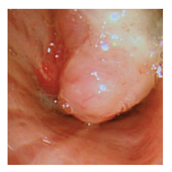
Fig. 4. Bronchoscopic finding. Subsequent bronchoscopy revealed a mass lesion almost completely occluding the left main bronchus at a site 4 cm below the carina and protruding to the endobronchial space. Bronchoscopic biopsy was performed.