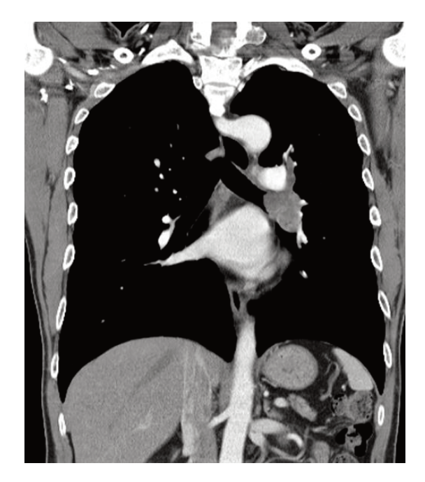
Fig. 3. On the computed tomography images, a mildly enhanced lesion with finger-like appearance was noted along the left main bronchus extending to the upper and lower lobar bronchi, as suspected on digital tomosynthesis.