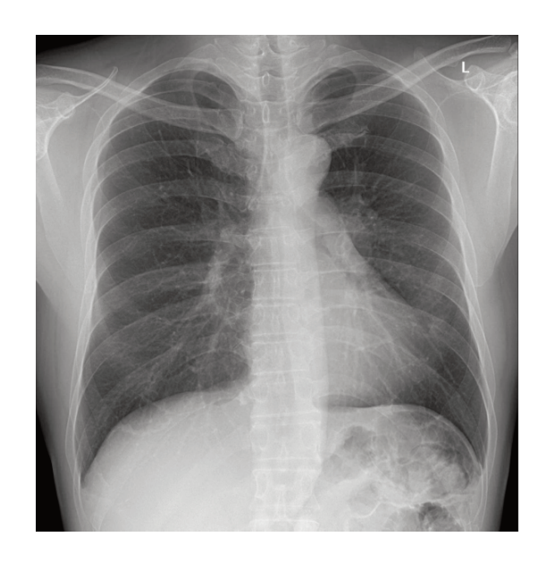
Fig. 1. Initial chest radiography. The endobronchial mass with left upper lobar bronchial narrowing was overlooked on the initial chest radiography.

DTS revealed that a lobulating contoured endobronchial lesion nearly obstructed the left main bronchus. Furthermore, we could examine the extent and margins of the endo-