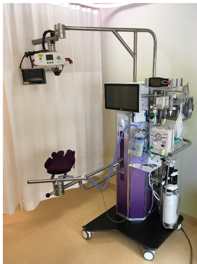
Figure 1 The Concord, a new specially designed resuscitation table, including the platform for the infant, which can be turned above the mother's pelvis. The table is fully equipped to provide complete standard care and has a built-in respiratory function monitor.

A new custom-designed resuscitation table (the Concord, figure 1 ) was used to provide full standard of care for stabilisation of preterm infants at birth with an intact umbilical cord. The Concord is a mobile device, of which the platform can be adjusted to be positioned in very close proximity to the birth canal without stretching the umbilical cord. The platform contains a slit through which the umbilical cord can be placed. The table is provided with the same equipment for resuscitation as used in our standard resuscitation table, being a T-piece ventilator, radiant warmer, suctioning device,