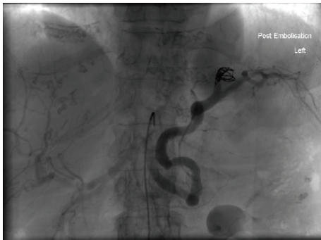
FIGURE 2: Coeliac arteriography coronal plane demonstrating embolisation of the splenic artery pseudoaneurysm.

The patient was managed with intravenous fluid replacement and 10 mg vitamin K. Warfarin was stopped. A flexible sigmoidoscopy was performed with no polyps or masses identified and fresh blood and clots seen throughout the sigmoid colon. The patient continued to report bleeding and repeat haemoglobin had decreased to 81 g/L. Two units of packed red cells were transfused and an oesophagogastroduodenoscopy revealed atrophic gastritis and a prepyloric erosion unlikely to be the source of bleeding. Following this computed tomography (CT) angiography showed a splenic artery pseudoaneurysm with associated collection and fistula to the transverse colon at the level of the splenic flexure (Figure 1).