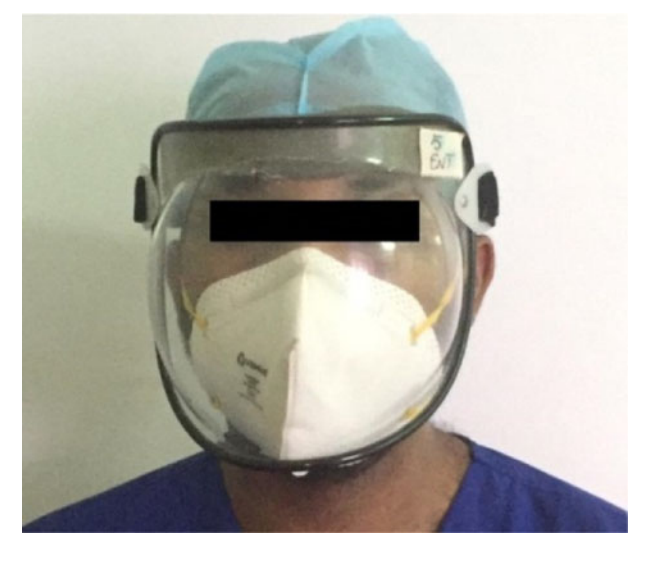
Fig. 1. The N95 mask and face shield used by the audiologist during speech audiometry testing with personal protective equipment.

audiometer. Pure tone air conduction and bone conduction thresholds were obtained for frequencies of 250–4000 Hz. Thresholds up to 25 dB across the frequencies 250–2000 Hz were considered normal. The pure tone average was calculated using thresholds at 500, 1000 and 2000 Hz, and was also used to check the validity of the speech audiometry results. This was achieved by checking there was not more than 12 dB discrepancy between the pure tone thresholds and the speech reception threshold.