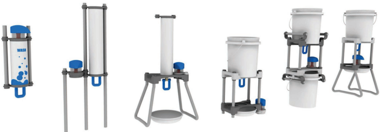
FIGURE 4. Potential Adaptations to the Povu Poa Handwashing System

(A) Users can operate the Povu Poa Swing Tap hygienically with the back of their hand. The swing tap dispenses water from up to 3 holes; users can control the amount and flow of water coming from these holes based on how far forward or backward they pull/push the tap. (B) The Povu Poa Soap Foamer creates foam by mixing soapy water and air.