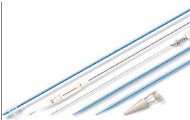
Figure 1. Content of the Suprapur® cystostomy set (from left): dilation balloon catheter (Ch12, 5 ml balloon) with a cylindrical tip, a Lunderquist guidewire (70 cm length) with an insertions guide, a puncture cannula 17.5 GA with a needle length of 18.5 cm, two facial dilators (Ch 10 and Ch 14) and a catheter plug.

Of the 96 possible candidates assessed for SPC placement during the study period, 26 met our inclusion criteria. Table 1 presents the patient characteristics of the study population. Mean patient age was 65.2 (±17.9) years and mean BMI 28.8 (±3.8) kg/m 2 . The average maximum bladder capacity was 210