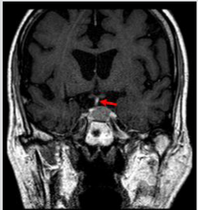
Figure 2. Coronal postcontrast T1-weighted image exhibiting a hypointense pituitary lesion relative to the adenohypophysis, asymmetric, with 14×12×14 mm (CC×TR×AP) maximal diameters, causing mild right lateral deviation of the pituitary stalk (red arrow); it insinuates into the left cavernous sinus. Imaging findings are suggestive of macroadenoma