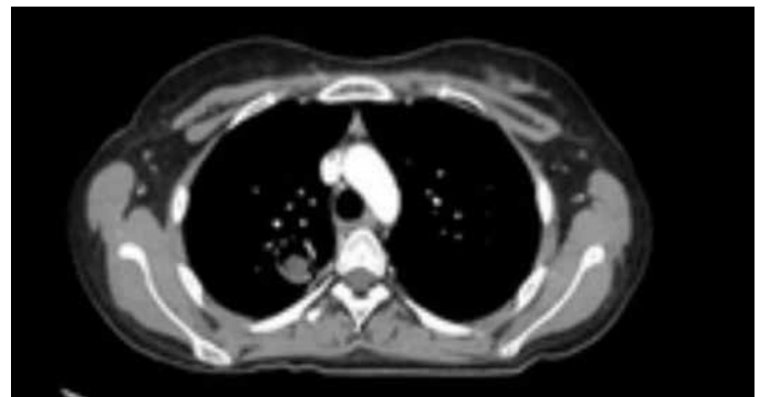
Figure 1. Thorax computed tomography with halo sign.

Hemoptysis due to fungal invasion of the pulmonary