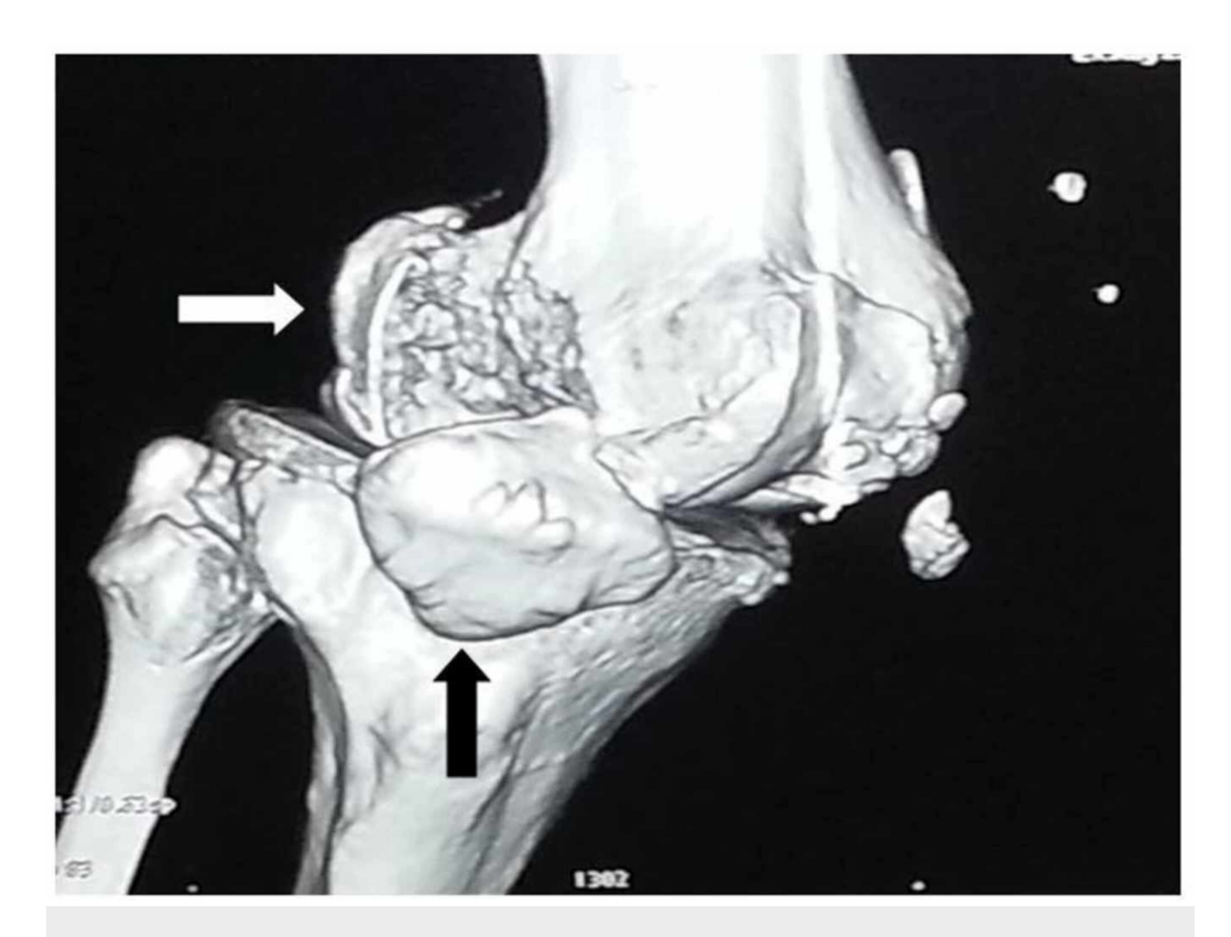
FIGURE 2: 3-D computed tomography showing Hoffa's fracture (white arrow) with patella dislocation (black arrow)