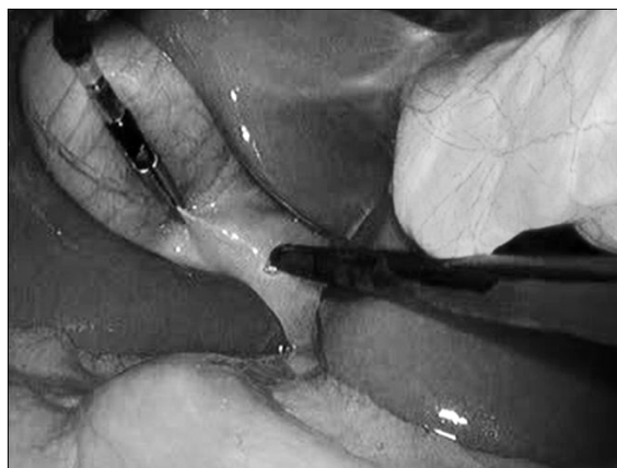
Fig. 1. Articulating grasper is being used at infundibulum, or Hartmann's pouch, for lateral dissection without any stay suture for cephalad retraction of gall bladder body.

sented SILC operation. Articulating grasper was used at the infundibulum or Hartmann's pouch for lateral dissection without traction by stay suture or 2 mm instruments for cephalad retraction of gall bladder body (Fig. 1). The gall bladder hilum was then dissected with dissector to expose the cystic duct and cystic artery which were clipped with 5 mm hemo-lock (Weck Closure Systems, Triangle Park, NC, USA) and a 5 mm Endoclip (Covidien Inc.), respectively and then divided with scissors. The gall bladder was dissected from the gallbladder fossa with hook electrocautery device. To allow removal of the gallbladder, the retrieval bag Endocatchbag (Covidien Inc.) was placed beneath the gallbladder fossa through the 10 mm port. The transumbilical wound was reapproximated with usual suture method. The operating process of conventional 3 port laparoscopic cholecystectomy was not significantly different from published operating method. Conversion of SILC or CLC was defined as open cholecystectomy or insertion of additional port.