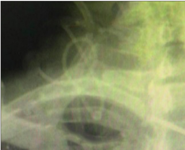
Figure 1. Enlarged chest X-ray, after an immediate attempt to remove catheter, suggesting a knot in the catheter, in addition to loop formation.

Catheter occlusion can occur due to a variety of conditions and even for no apparent reason. It is reported that this complication occurs in 36% of CVC cases [20]. Distal CVC obstruction is a rare complication [5,15], with most of the reported cases related to pulmonary artery catheters, probably because they are more flexible, longer, and do not have a guidewire [21].