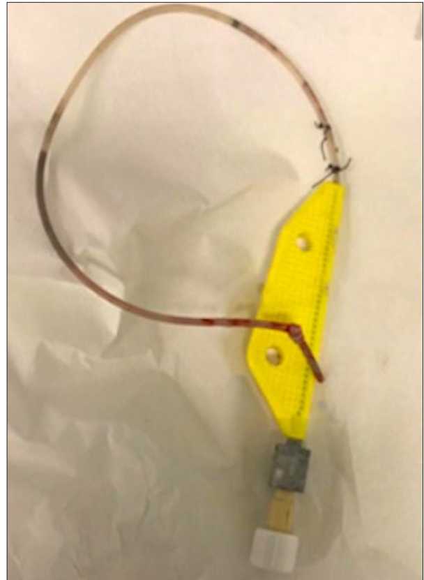
Figure 2. Single-lumen central venous catheter with a knot about 2.0 cm from the tip, after removal by venotomy under local anesthesia.

It is known that advancing a CVC without proper care can lead to knot formation [25], and making more attempts at catheterization