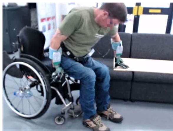
Fig. 2 Set-up of the experiment

eliminated from the calculation of transfer mean. This threshold was arrived at after consulting the video and concluding that forces under 20 N were often due to baseline noise of the sensors or to contact between the hands and other surfaces (hands resting on thighs).