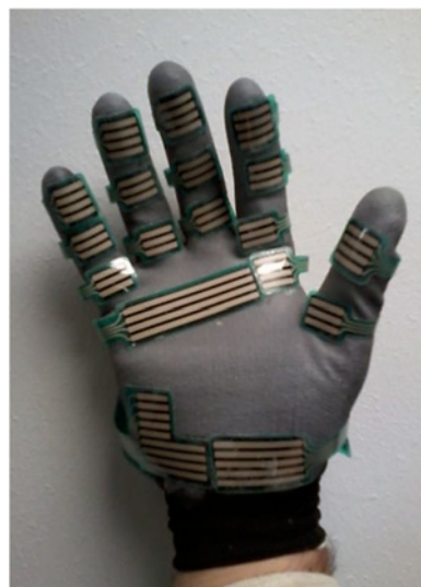
Fig. 1 Position of the sensors on the force sensing glove

Analysis of the Tekscan data was completed using a custom Matlab script (Matlab 2015b, Mathworks, Inc., Natwick, MA, USA). Reaction forces were normalised as a percentage of body weight as previously recommended by [5]. The gloves were calibrated according to the manufacturer instructions. For each transfer, the peak and mean forces above a threshold of 20 N were calculated for both leading and trailing hand. Force values <20 N were