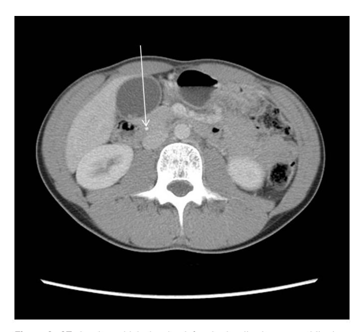
Figure 2. CT showing a high density defect in the distal common bile duct (arrow).

The radiologic and phenotypic appearance of this patient's stones and the timing of prolonged ceftriaxone therapy along with absence of any risk factors for cholesterol, mixed pigment, or black pigment stones—strongly suggest that his stones were secondary to the antibiotic treatment. Ceftriaxone has been associated with the formation of biliary precipitates, which Park et al identified as the calcium salt of ceftriaxone in 4 gallbladder specimens using thin-layer chromatography, high-performance liquid chromatography