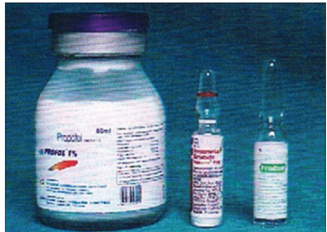
Figure 2: Propofol vial, vecuronium, and fentanyl ampoules