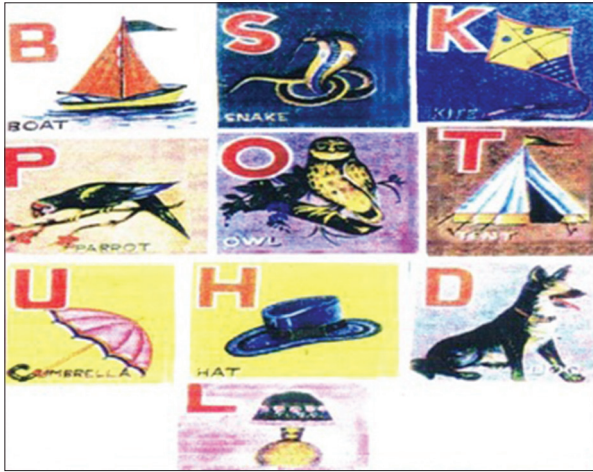
Figure 3: Picture card test

The data collected in the study were tabulated and analyzed using Statistical Package for Social Sciences version 16.0 software (SPSS Inc., Chicago, IL, USA). Descriptive statistics were calculated. Friedman test was employed to evaluate the significance of differences in HR and BP at different intervals of time. Confidence interval and P value were set at 95% and ≤0.05, respectively.