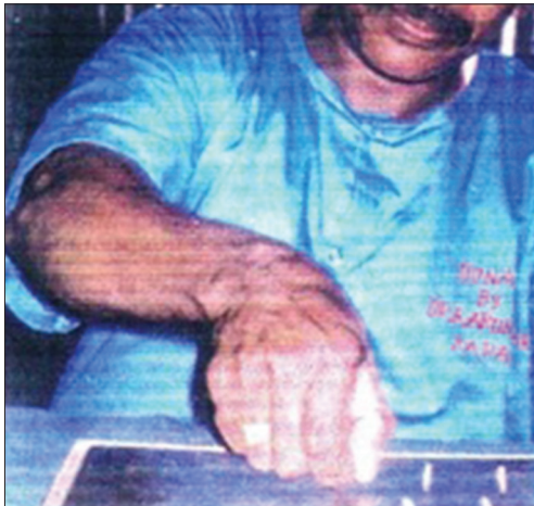
Figure 4: Picking of matches test