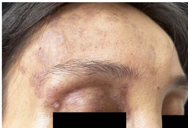
Figure 2 A band-like distribution of lichen planus-like lesions was observed on the right forehead, and the right eyelid was heavily pigmented.