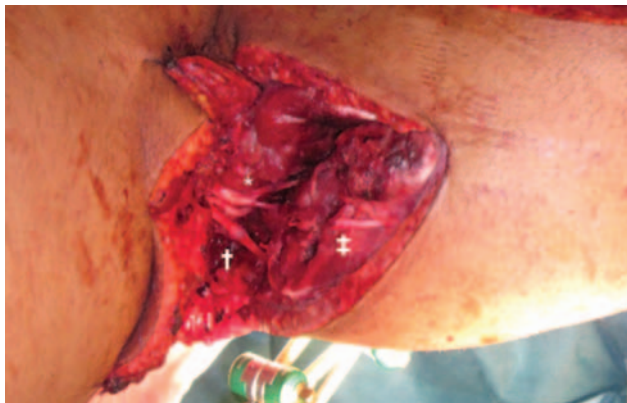
Figure 2: Intraoperative photography after fixation of the knee in 90° flexion and sutures of tibial (*) and common peroneal (+) nerve. Junction of the sural (‡) nerve has not yet been performed.