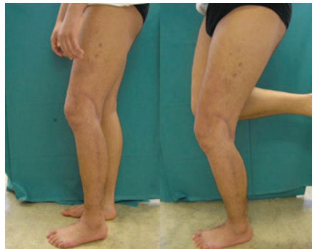
Figure 3: Clinical examination 6 months after trauma showed well-healed wounds and the possibility to stand on the left leg without aid.