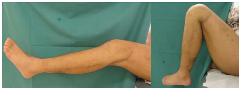
Figure 4: Good range of motion (flexion/extension 140-10-0°) 6 months after trauma.