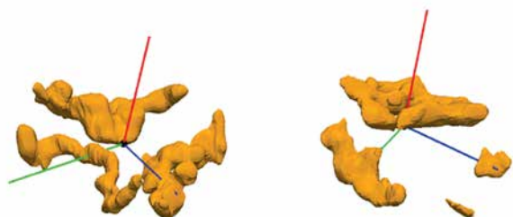
Figure 1. Exemplary reconstruction of aortic valve calcifications. Calcifications located in the aortic valve cusps. There is a variety of calcifications – asymmetric calcifications are visible on the right side and symmetrical distribution on the left side

Before TAVI, all patients had an MSCT examination evaluating the atherosclerotic deposits of the aortic valve. Non-contrast and contrast ECG-gated computed tomography examinations were performed with a dual source scanner (Somatom Definition Flash, Siemens Medical Solutions) with beam collimation of 64 \times 0.6 mm, 128 slices, a gantry rotation time of 280 ms, and tube voltage 100–120 kV depending on the patient's body mass. The scan of the heart ranged from the carina to the heart base. The patients did not receive any medicine regardless of the heart rate. Morphometric assessment of calcifications was carried out in three aspects: the volume, area and curvature of calcifications (Figure 1). The starting point for evaluation was the spatial reconstruction of the surface edge using the marching cubes algorithm.