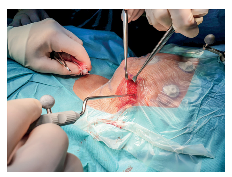
FIGURE 4. All stones were removed following the navigational trajectory with a transcutaneous or transoral approach.