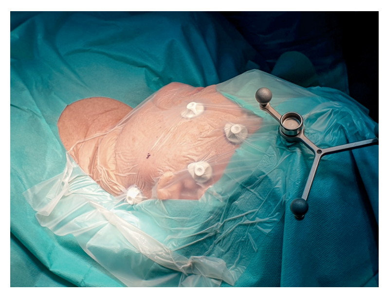
FIGURE 1. Patient, prepared for surgery. With fiducial markers attached to the skin and navigational star on the patient's forehead (BrainLab, Munchen, Germany).