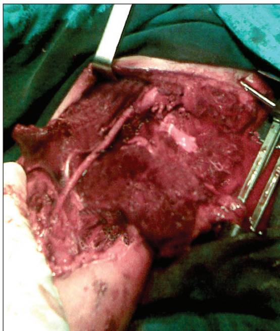
Figure 2. Reconstruction of crushed brachial artery with saphenous vein interposition graft.

requiring prompt surgery. Additionally, preoperative angiography did not offer any benefits in patients with obvious arterial injury. Angiography may be useful, especially in patients with multiple sites of potential vascular injury. 10 We have used angiography in patients with stable axillary artery injury associated with chest trauma causing subcutaneous emphysema, which prevented ultrasonographic examination. Additionally, angiography