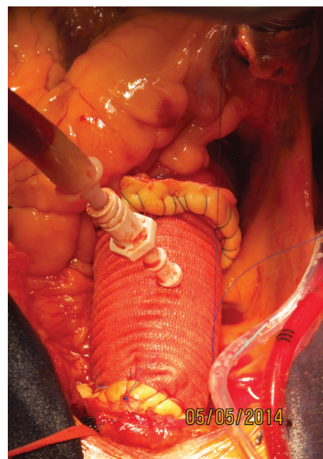
Fig. 2. Control of bleeding with administration of cardioplegia via a needle over the graft.

In patients with additional cardiac pathologies, aortic replacement was completed after the surgical procedure for the cardiac pathology had been carried out. In patients undergoing aortic root replacement with a valved conduit, a modified Bentall procedure with flanged graft was used, as we believe that this approach may help reduce the risk of tissue–prosthesis incompatibility as well as the risk of bleeding, in addition to shortening the duration of anastomosis. 5 When simultaneous coronary bypass surgery was done, proximal anastomoses were