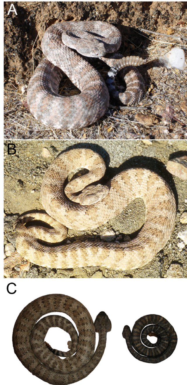
Figure 1. Photos in life of a typical adult speckled rattlesnake from Isla El Muerto (A) and a typical adult speckled rattlesnake from Isla Ángel de la Guarda (B) (both males). (C) Preserved specimens from A (right) and B (left) photographed to scale, showing size difference.

The peninsula of Baja California extends for approximately 1250 km in a northwest-southeast trajectory, separated from the