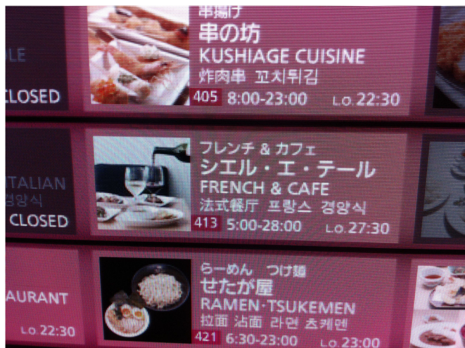
Fig. 3. Today one occasionally finds an example of Maya-style notational non-uniqueness in our representation of time. Information on restaurant opening hours at Tokyo Haneda airport; notice the opening hours and time for Last Orders of the second entry.

rather than 13:05; but see Fig. 3. However, one instance where we are perfectly comfortable with such nonuniqueness today is in currency, where coins and notes in denominations often based on 1, 2, 5 permit us to pay a given sum of cash in multiple ways.