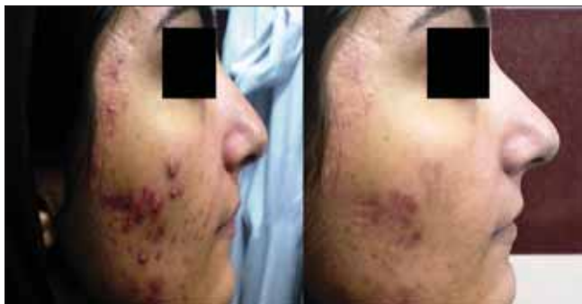
Figure 2: The number of inflammatory and non-inflammatory lesions reduced significantly after 8 weeks of treatment with topical dapsone gel plus isotretinoin as shown in these pictures

AEs: Adverse events. ( P < 0.001 ) is statistically significant