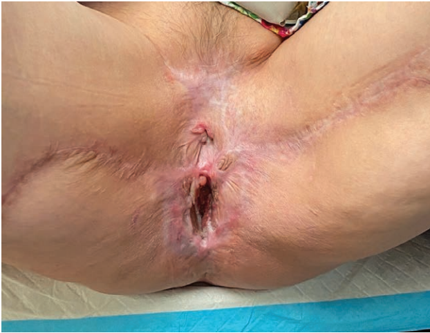
Fig. 4. Follow-up image showing vaginal orifice after gradual dilation.

The development of a symptomatic intraluminal rectal mucocele has been rarely reported in the literature. 11 A mucocele is an abnormal collection of mucus without adequate drainage in a structure that normally produces mucus. Mucoceles are commonly associated with the gallbladder, appendix, craniofacial sinuses, and other hollow organs that secrete mucous. 12 Most cases of intraluminal mucoceles have been associated with inflammatory bowel disease and subsequent anal stricture formation. 13 However, distal obstruction does not allow for adequate drainage and results in the development of a mucocele, which, with continued growth, can become symptomatic. Without complete removal of the mucous producing tissue, drainage will only temporarily improve symptoms, as seen in our patient after percutaneous drain placement. 13