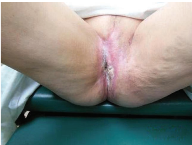
Fig. 1. Preoperative photograph showing Lichen Sclerosus.

Both vaginal and perineal reconstruction are complex and have been well described in the literature. Our aim is