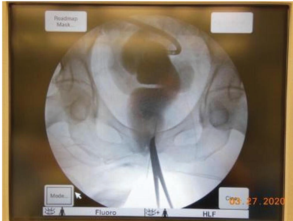
Fig. 2. Intraoperative fluoroscopic localization.