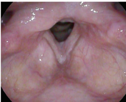
Figure 3. Endoscopic view shows no sign of mass recurrence 2 months after the surgery.

Large masses positioned around the vocal cord area cause major difficulty for anesthesiologists. When patients are sedated in the supine position, the mass may fall backward by its own weight, obstructing the airway. Therefore, it may suddenly become difficult to apply mask ventilation even to asymptomatic patients after they have fallen asleep. The volume of the mass itself may block most of the vocal cords, leaving little space for the ETT to pass through. 2,3,8 Moreover, there is a risk that mass particles may be dislodged and become aspirated deeper in the airway along with the tip of the ETT. These problems pose hardships for anesthesiologists because they can affect surgical outcomes, and they may even threaten the patient's life. 5,7,9