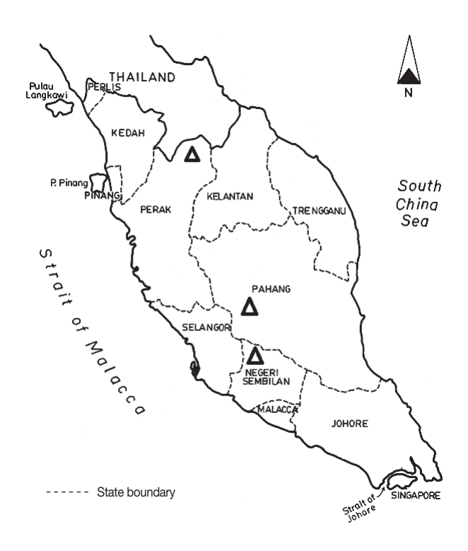
Fig. 1. Map showing the location of the villages in Peninsular Malaysia involved in the study (triangles).

232 Korean J Parasitol Vol. 51, No. 2: 231-236, April 2013