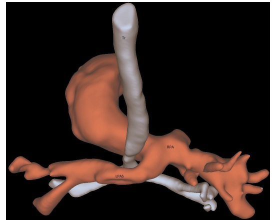
Figure 2 A 3D-reconstructed CT image (posterior view) shows LPAS arising from the right pulmonary artery (RPA) crossing behind the trachea (Tr) causing stenosis. LPAS, left pulmonary artery sling.

Postoperative bronchoscopy showed an improvement in the distal trachea caliber, without inspiratory collapse and incomplete cartilaginous rings. He was extubated on the first postoperative day showing a regression of the stridor, despite persistent respiratory distress. The patient was discharged 8 days