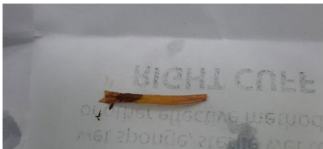
FIGURE 3 Full image of the fishbone

The boy recovered very well and was discharged after 7 days of treatment in stable condition. Nevertheless, after all of this, his family still cannot remember clearly that whether their son ate fish that day or not. All they can make sure that their family regularly ate fish for dinner.