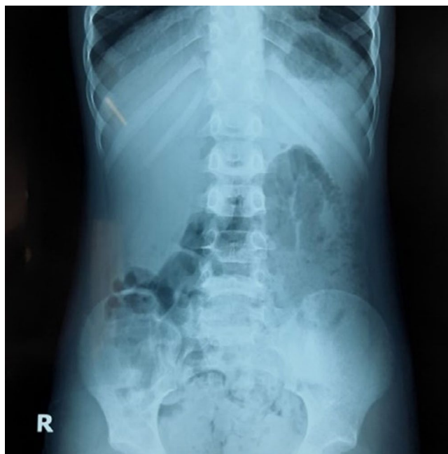
FIGURE 1 The patient's abdominal X-ray

Gastroscopy and enteroscopy are popular methods to remove the gastrointestinal foreign bodies. Only 1% of cases need surgical excision. However, depending on the perforation site and clinical symptoms, treatment could be chosen through suture perforation site, bowel resection, or Hartman procedure. 8 Laparoscopic surgery caused less damage than traditional laparoscopic surgery, so it has gradually replaced the traditional method of abdominal open exploration. Currently, laparoscopic surgery is the preferred method of choice. 11 In our case, because there was no precise diagnosis, we chose laparoscopic surgery. During the surgery, we found a sharp fishbone punctured the intestine from the lumen of the intestine to the outside, about 35 cm from the ileum—cecum, and the patient's appendix was normal. We removed the fishbone, stitched the hole, cleaned the abdomen, and closed the incisions.