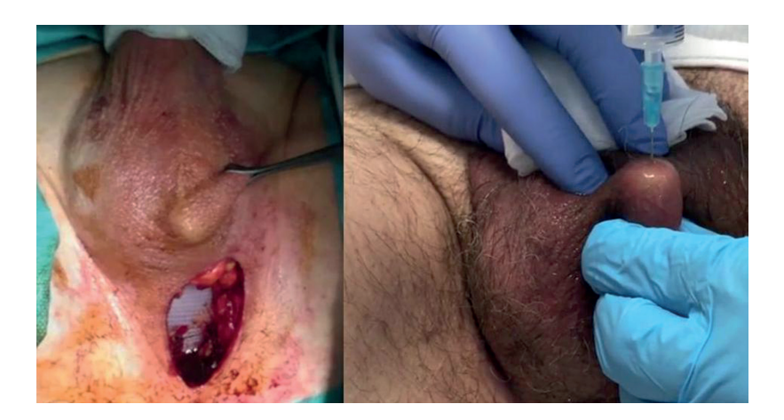
Figure 4 - Dartos scrotal pouch that accommodates the port; refill at clinical visit.

cedure and 4 (7.7%) an unilateral NS procedure; 8 had undergone urethrotomy for an urethral stricture, 7 had undergone vesicoureteral anastomosis resection; at pathology report all patients were diagnosed with prostate adenocarcinoma, clinical and pathological stage are reported in Table-1. Six patients had undergone adjuvant radiotherapy, 5 were on hormone therapy with LHRH analogue / LHRH antagonist. All patients were in complete remission from cancer disease, in cases of radical prostatectomy with undetectable PSA. Preoperative urodynamic testing demonstrated in all patients a good bladder compliance (> 20 cmH<sub>2</sub>0 / mL), absence of DO and the presence of uro-