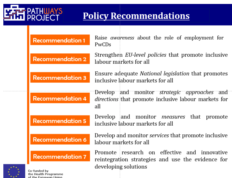
Figure 2. Pathways Policy Recommendations for NCDs and employment.

The real challenge, for an approach where health is considered in all sectors, is to develop an employment sector able to adapt to each person's needs and that does not constrain persons to adapt to employment that is a barrier to their health. An inclusive labour market for all will greatly support health for all.