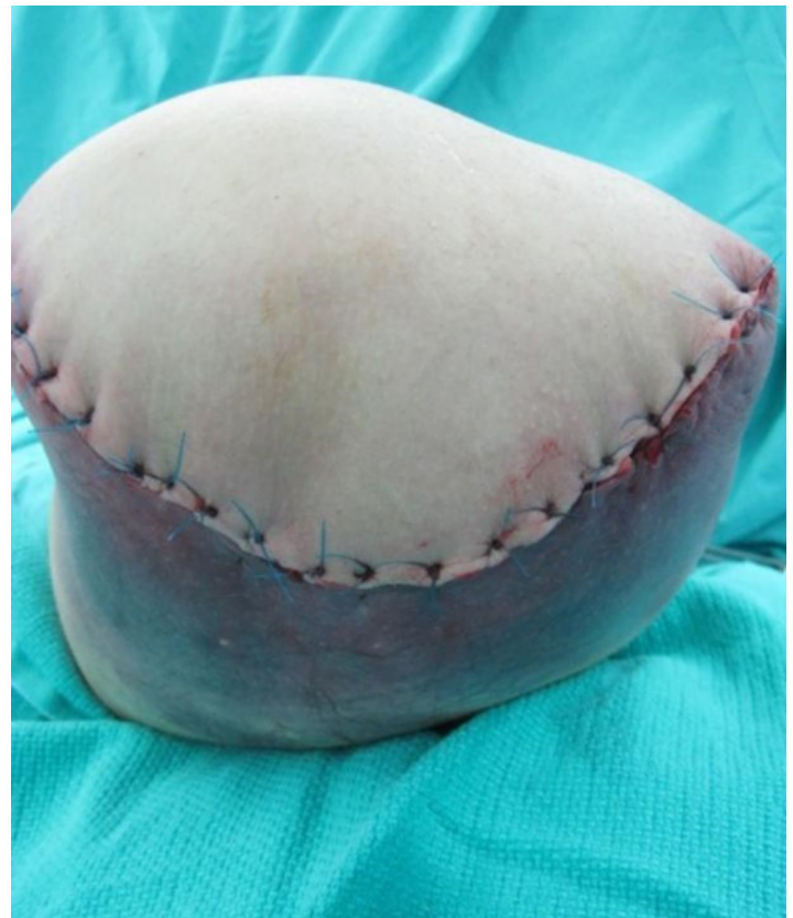
Figure 3. Left above-knee amputations performed after blunt trauma of the knee.

A fish-mouth incision was performed over the skin and the fascia. The bone was shortened 10 cm proximal to the femoral condyle. The popliteal artery and the vein were identified, tied, and cut. The proximal sciatic nerve was dissected, tied, and cut. The adductor magnus muscle was attached to the distal femur rudiment with ticon sutures. The amputation stump was sutured (Figure 3). Following surgery, when the