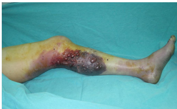
Figure 1. Ecchymosis, hemorrhagic bullae, and cyanosis posterior of the left knee and cruris.

emergency department (ED) with an isolated crush injury of the left leg 18 hours after lateral and medial sides of his left knee was temporarily squeezed at a high speed between a tree and an operative machine. The patient's history revealed that he presented to the hospital 5 hours after the injury as the skin did not have a laceration. Investigation of the epicrisis reports and hospital records revealed that the patient underwent Doppler ultrasonography at the sixth hour. The Doppler examination revealed the presence of a probable thrombus