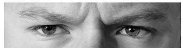
Fig 1. Photographs of signs 2 and 3, illustrating the two types of wording used and images of eyes and pawprints used respectively as the treatment and control. The signs had a brown wood-effect background with yellow borders and text. The eyes and pawprints were greyscale.

https://doi.org/10.1371/journal.pone.0207246.g001